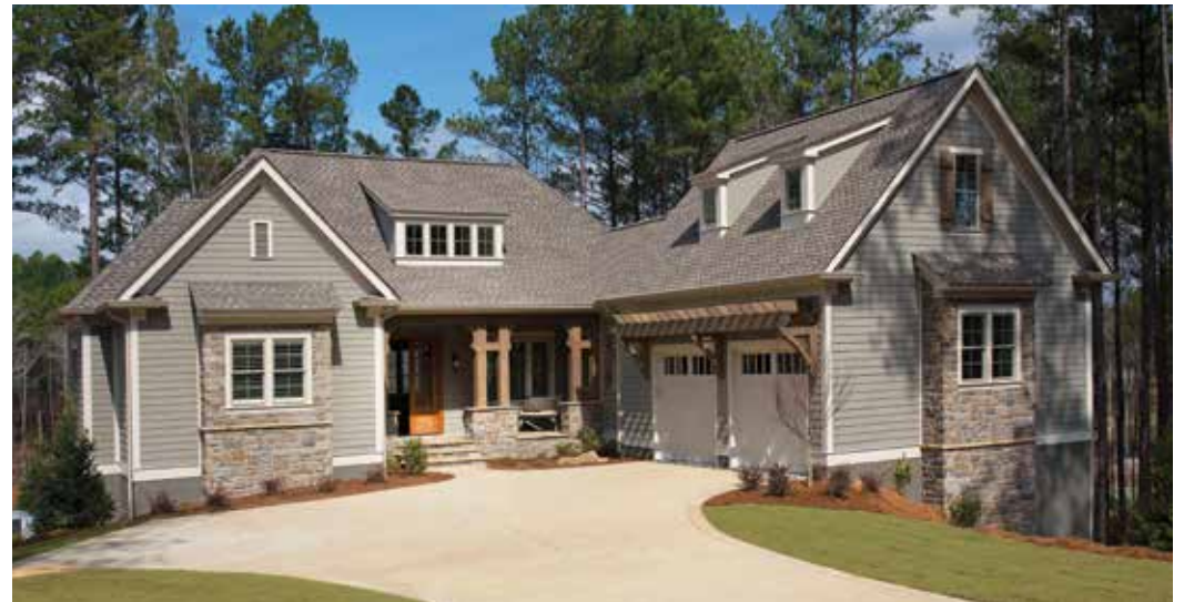
Series 30 - A natural wood pergola spans the twin garage doors, echoing the hearty columns that frame the entryway.