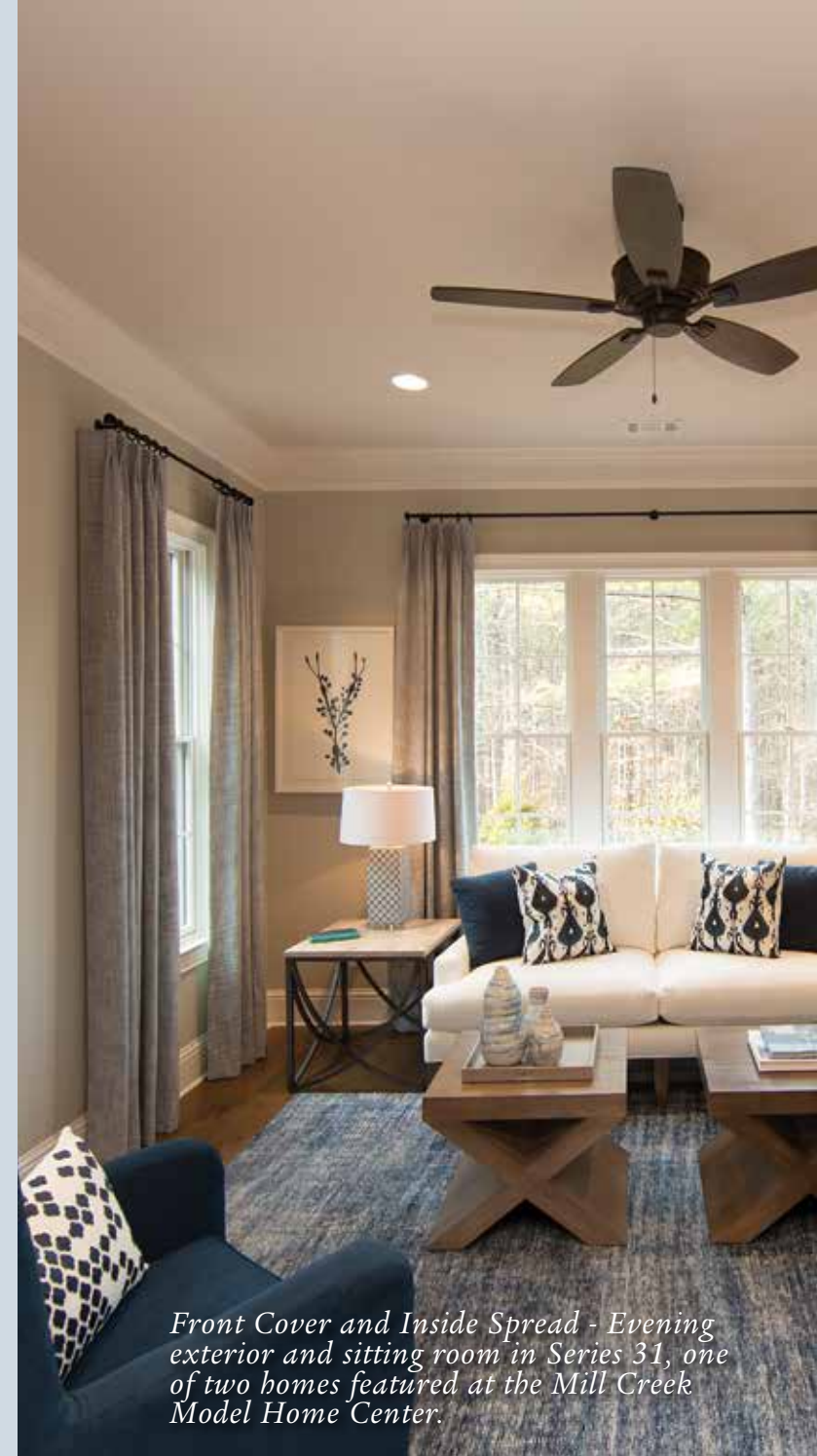
Front Cover and Inside Spread - Evening exterior and sitting room in Series 31, one of two homes featured at the Mill Creek Model Home Center.