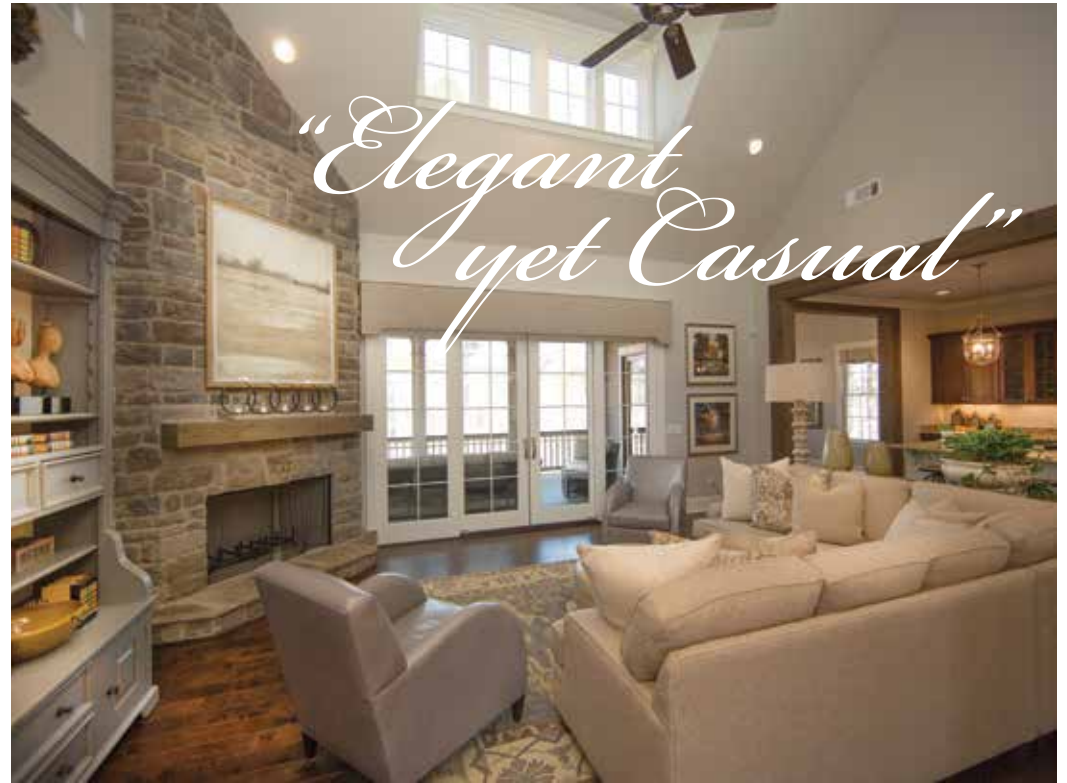
Series 30 - Elevated ceilings and clerestory windows flood the main living space with warm, natural light.

Inside, the 3,700-square-foot, four-bedroom, four-and-a-half bath home is intimate in scale, but has an open, airy character. This is created by vertical lines, elevated ceilings, eight-foot interior doors and clerestory windows that flood the main living space with warm, natural light. Hardwood floors, premium tile, granite and cabinet upgrades throughout the