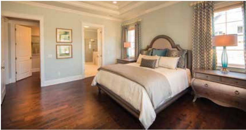
Series 30 - Hardwood flooring and tray ceilings highlight this master suite.

By combining a magnificent golf-front setting with inspired architectural elements and engaging some of the top building and interior design experts in the field, Winslette and his team succeeded in their mission. The result is a pair of exquisite new model homes now open daily for tours on Mill Creek.