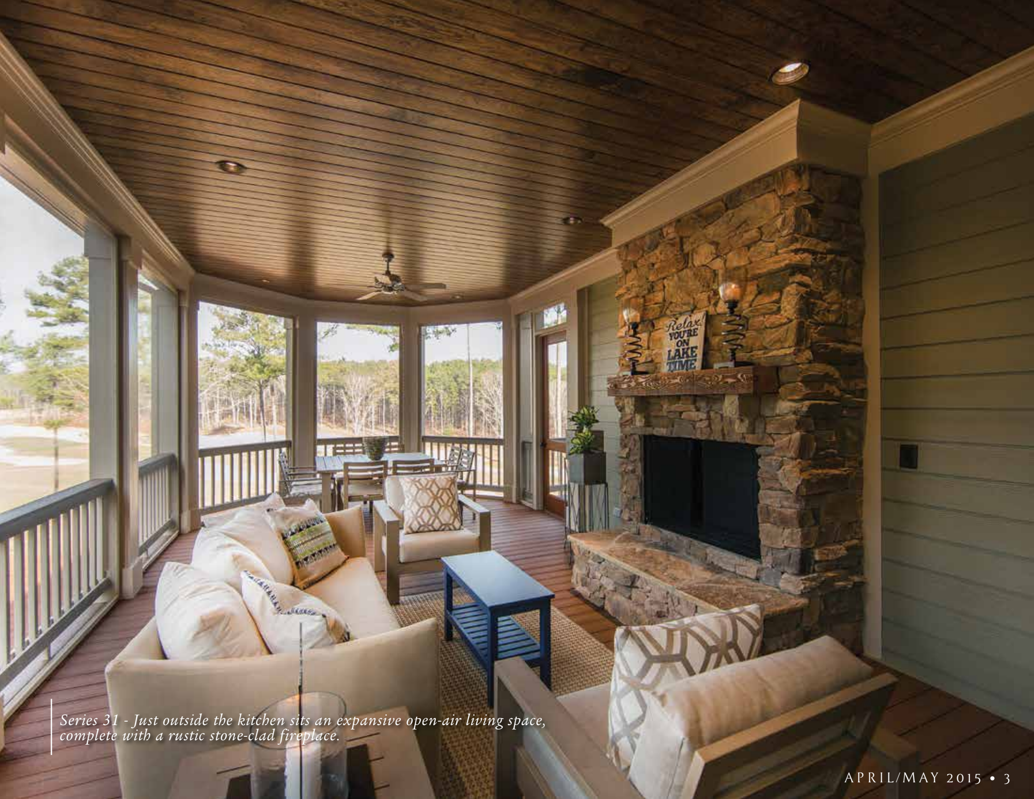
Series 31 - Just outside the kitchen sits an expansive open-air living space, complete with a rustic stone-clad fireplace.