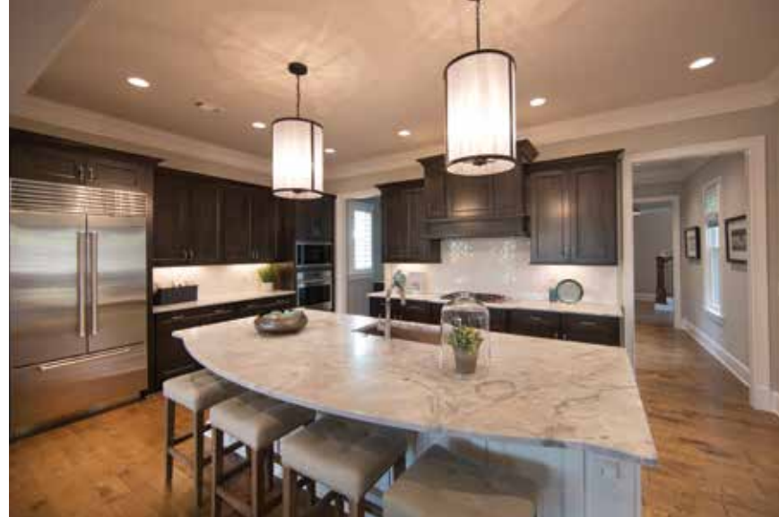
Series 31 - The dazzling gourmet kitchen features Wolf appliances, premium cabinets and top-quality granite countertops.

Series 31 - His and her vanities with granite countertops and garden tub are featured in this master bath.