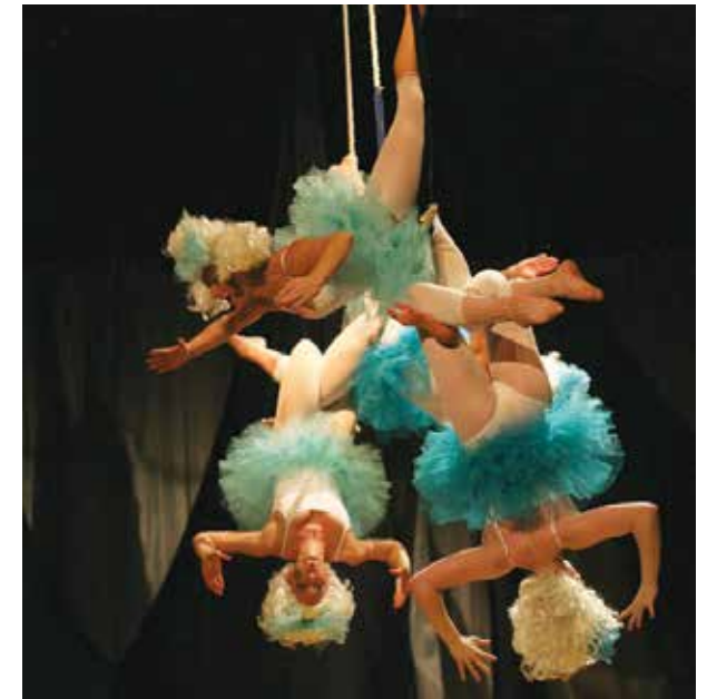
“Canopy” Flying Aerial Dance Trapeze held November 2007 in Athens, GA.