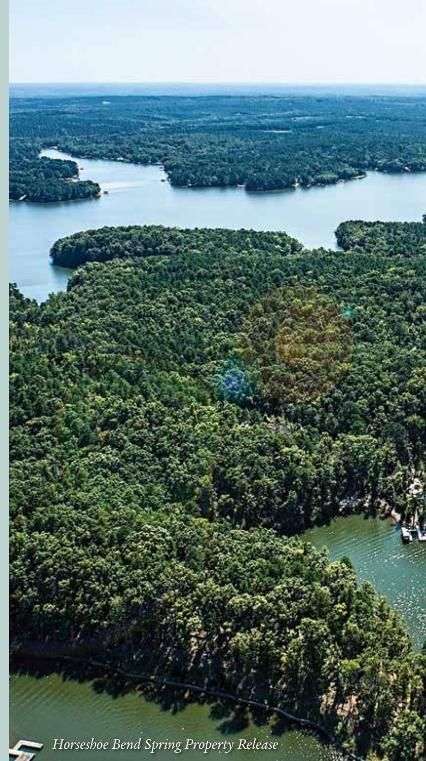
Horseshoe Bend Spring Property Release