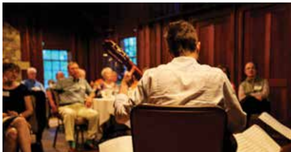
“An Evening of Revin to Celebrate Spring” Prelude Dinner and Concert held April 2015 at the Rock House.

This variety of quality programming ranges from lectures and discussions, hands-on experiences,