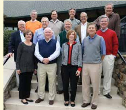
2015 Board of Advisors

Applications and committee-specific qualifications are available on the BOA page at www.reynoldsplantation.net . If you have any questions, please don't hesitate to contact any current BOA member.