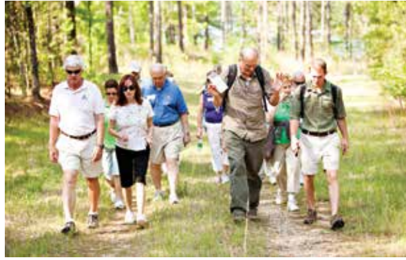
“Wildflower Walk” Nature Excursion held June 2011 at the Sandy Creek Barn.

“You and your audience gave us the greatest gift possible, which were your full hearts and minds. In return, this reached my students deeply and validated that what they do is meaningful and important. It was an unforgettable evening. I’ve performed and organized hundreds of concerts in my career and this without a doubt now claims a top spot for most memorable and special experiences. The fact that it affected my students so viscerally is a gift to me.”